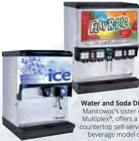
Water and Soda Dispensers Manitowoc's sister company, Multiplex®, offers a complete countertop self-service ice and beverage model offering.

Find the perfect ice machine pairing with Manitowoc's wide variety of ice storage bins and dispensers.