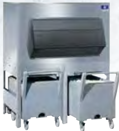
Ice Storage Bin and Cart System

Equipped with ice gate for increased employee safety, easier ice removal, and reduced spillage. The 30" (76.2 cm) model is one of the smallest footprint large capacity storage bins available.