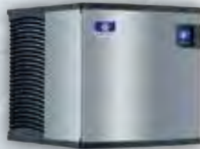
Modular Ice Machines

Featuring high-volume dispensing with patented "push-for-ice" rocking chute dispense mechanism and paddle wheel technology. Also available in an ice and water dispensing.