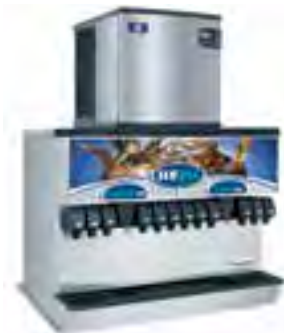
iT420 ice machine on Multiplex® MDH-302 beverage dispenser

Manitowoc dice or half dice cubes crushed into small pieces using a Maniowoc machine and a Multiplex® beverage dispenser equipped with icepic® ice crusher. Provides a selection