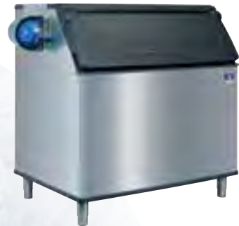
D-Style Ice Storage Bins Available in 22" (55.9 cm), 30" (76.2 cm) and 48" (121.9cm) widths. Featuring one-piece corrosion-free composite-resin base, impact-resistant polyethylene bin liner, soft durameter trim that helps silence bin closing, internal scoop holder and protectant bumper guards. Optional Multi-mount external scoop holder also available.