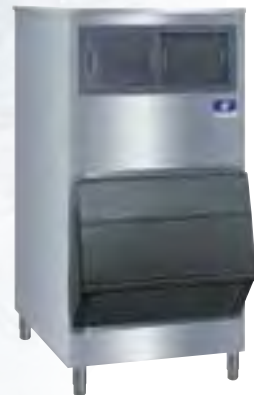
F-Style Large Capacity Ice Storage Bins

Available in 22" (55.9 cm), 30" (76.2 cm) and 48" (121.9 cm) widths.