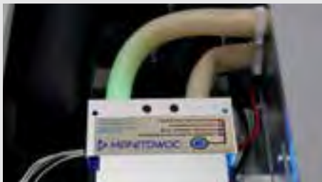
With LuminIce II

The LuminIce II space-saving design fits inside the ice machine so existing exterior clearances are not impacted. In addition, power for the unit is supplied through the ice machine's internal electrical supply so outlet space is conserved.