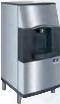
SPA and SFA Series Ice Dispensers

Available in 22" (55.9 cm) and 30" (76.2 cm) widths.