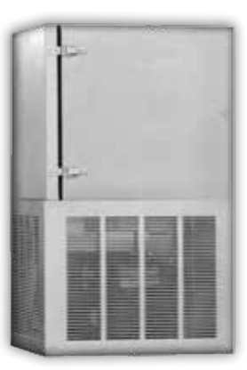
Indoor wall mount Capsule Pak