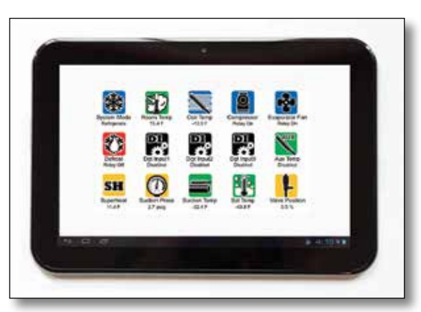
With Enviro-Control and an optional router you can monitor and control your system from your desktop, smartphone or tablet.

Enviro-Control allows you to adjust many functions of your refrigeration system through the simple interface located on the front of the evaporator coil.