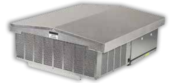
Outdoor ceiling mount Capsule Pak