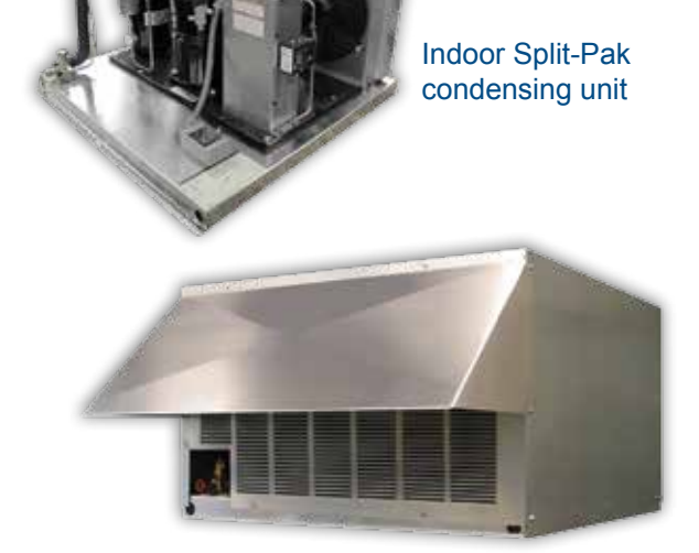
Outdoor Split-Pak condensing unit