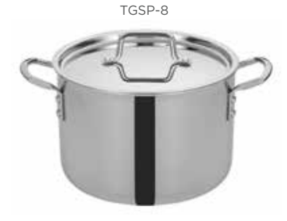
13-3/4"W x 7-3/8"H including handles