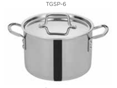
13"W x 6-5/8"H including handles